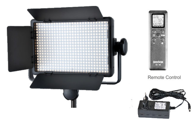
LED Video Light